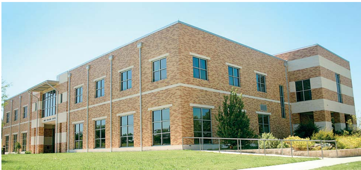
Temple College NEB Administrative Building

Temple College retained the services of Johnson Controls Inc. of Milwaukee, an energy services company, or ESCO, who determined that numerous large glass windows were contributing substantially to the campus' overall energy inefficiency. Johnson Controls determined that LLumar energy-control window films, which would significantly reduce summer solar heat gain and winter heat loss through these windows, should be an important part of an effective energy-saving strategy for the college.